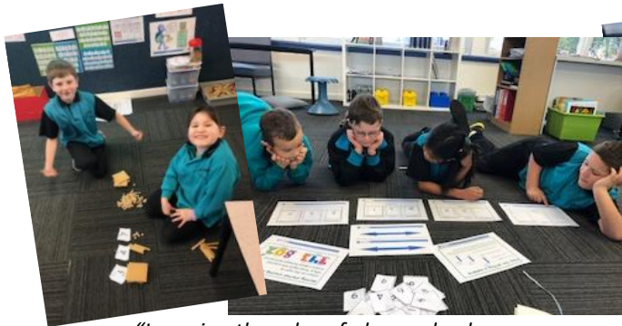
"Learning the rules of place value became easy when I got used to it". – Savannah

(Five sextillion, nine hundred and seventy-two quintillion is Earth's mass)